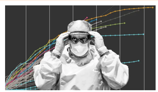
The Financial Times is making key coronavirus coverage free to read to help everyone stay informed. Find the latest here.

UK construction activity has fallen at the fastest pace since the financial crisis as many builders ceased work and the pandemic hit demand. The PMI for UK construction dropped to 39.3 in March from 52.6 in the previous month.