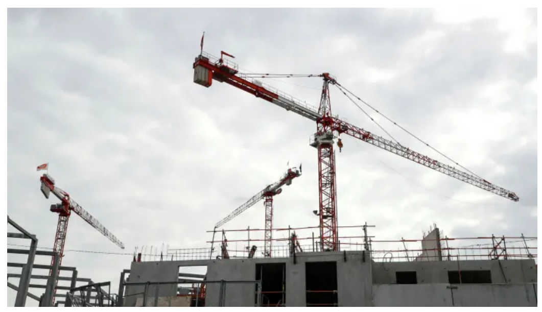
A stalled construction site in Ivry-sur-Seine, suburbs of Paris

Coronavirus damage to economy drives eurozone investor sentiment to a record low